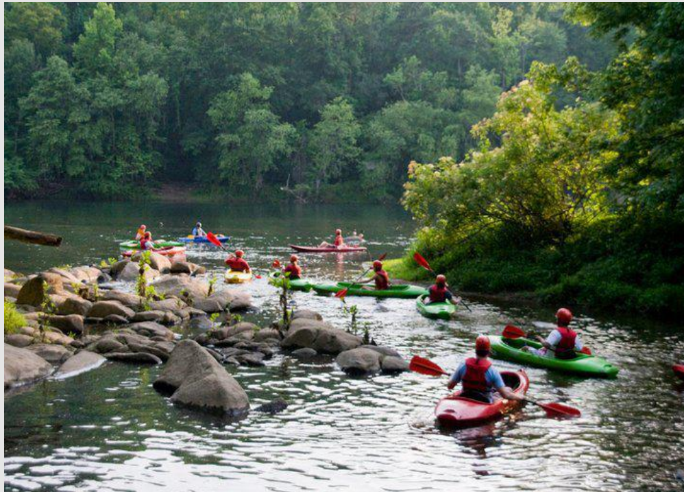
Kayakers enjoying the Lower Saluda River near the Zoo.

Congaree Riverkeeper protect and improve water quality, wildlife and recreational opportunities on the Congaree, Little Congaree and Lower Broad Rivers through advocacy, education and enforcement of environmental laws.